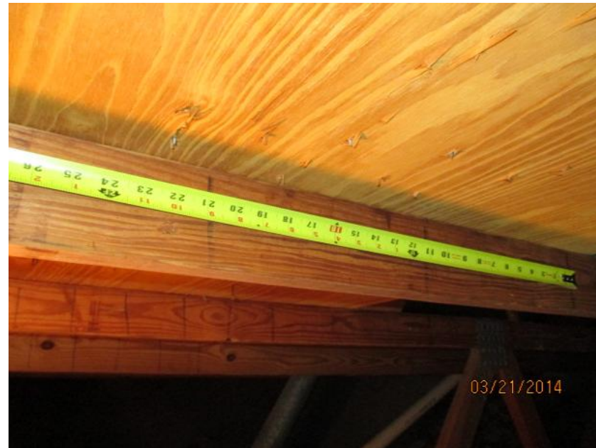
8d Nails Spaced 12" in the Field