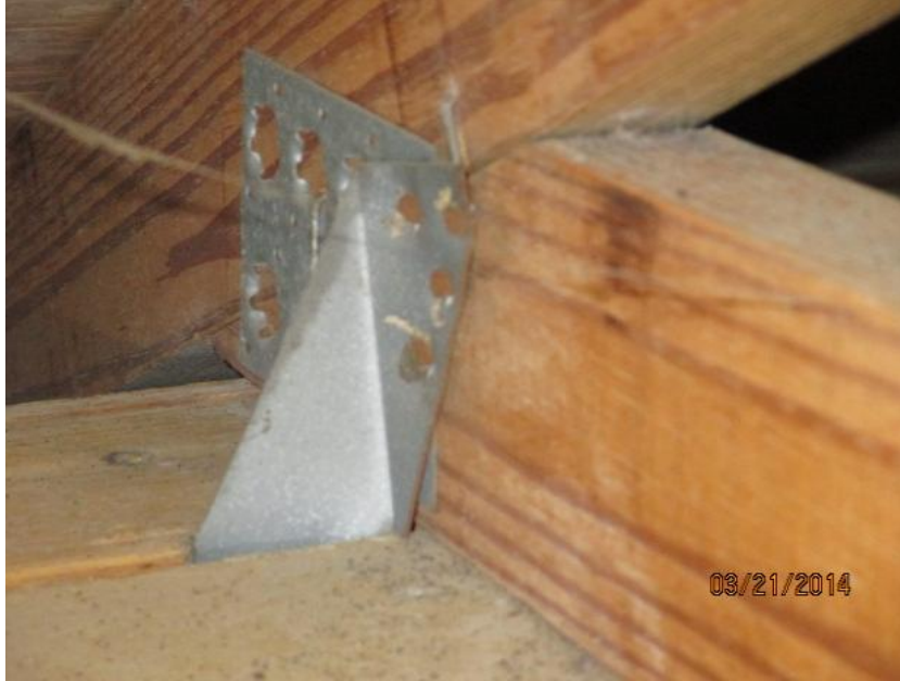
Clip with 3 nails on the front side and 0 nails on the opposing side