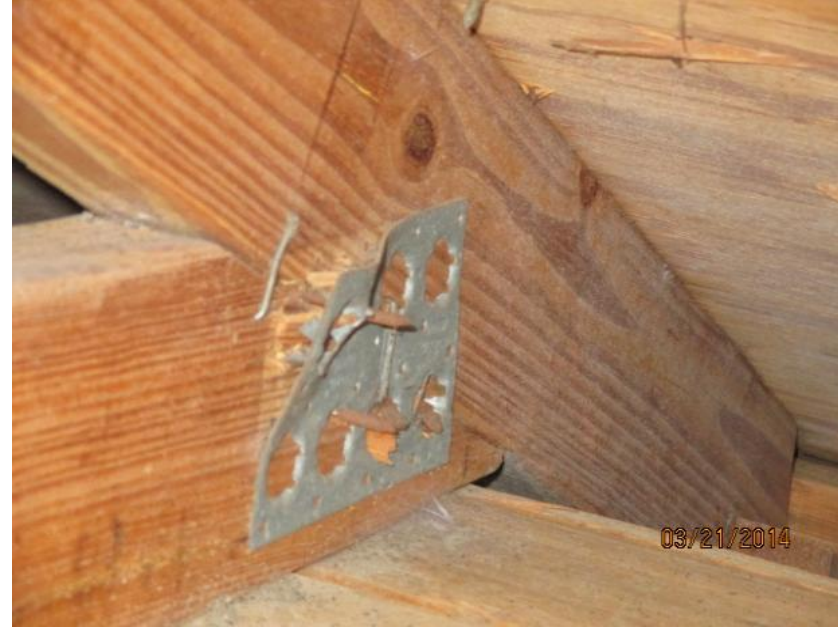
Clip with 3 nails on the front side and 0 nails on the opposing side