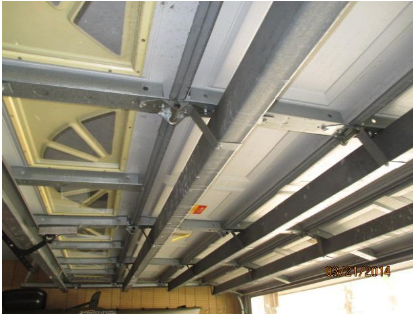
Unprotected Glazed Garage Door