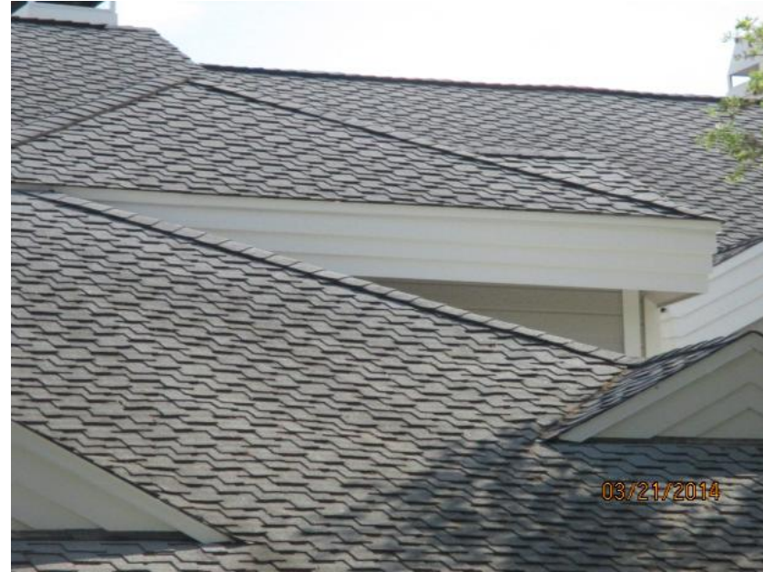
Asphalt/Fiberglass Shingle Roof Covering