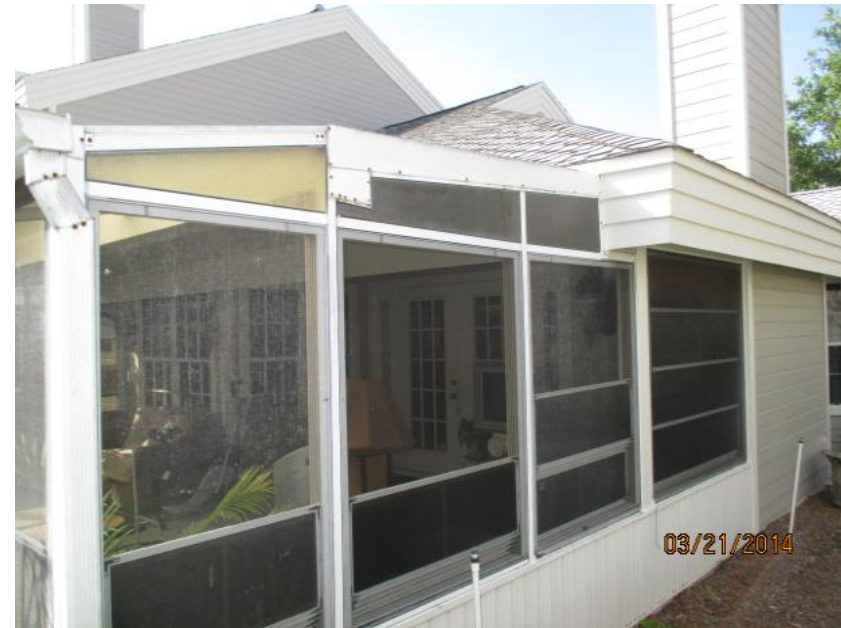
Unprotected Glazed Entry Doors