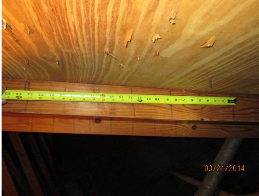
8d Nails Spaced 6" Along the Edge