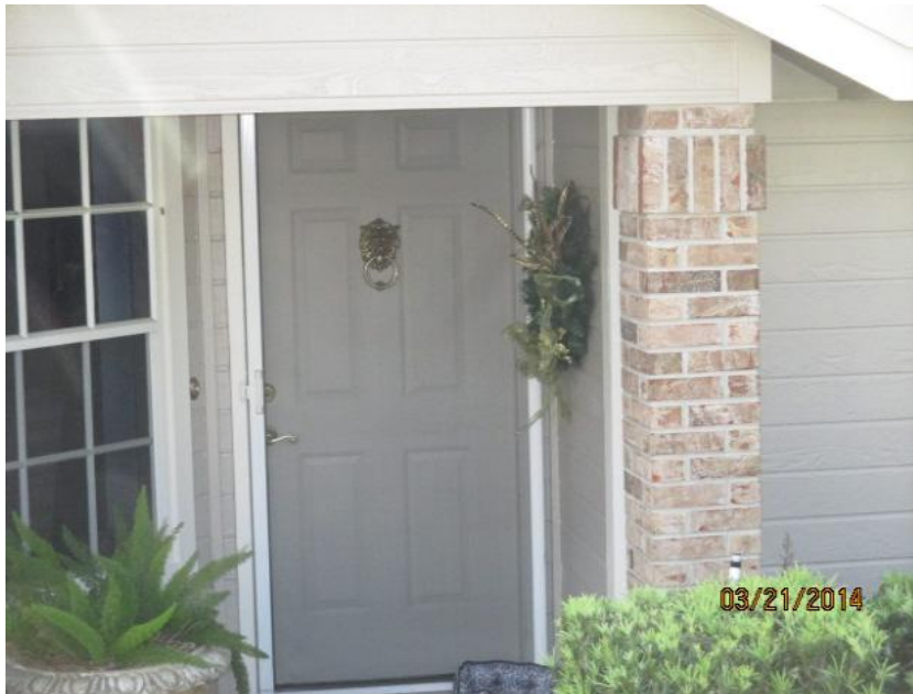
Unprotected Solid Entry Door