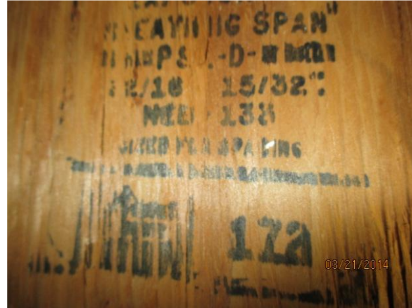
15/32" Deck Thickness Confirmed