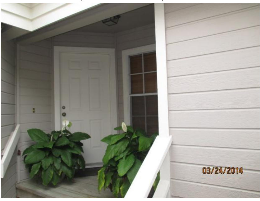
Unprotected Solid Entry Door