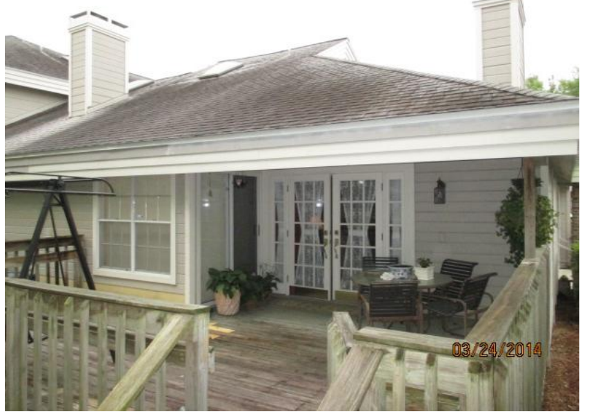
Unprotected Glazed Entry Doors