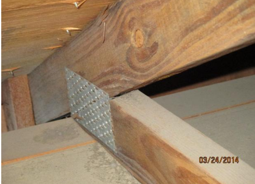
Clip with 3 nails on the front side and 0 nails on the opposing side