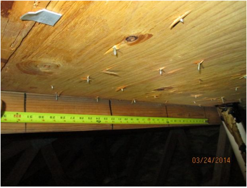
6d Nails Spaced 12" in the Field