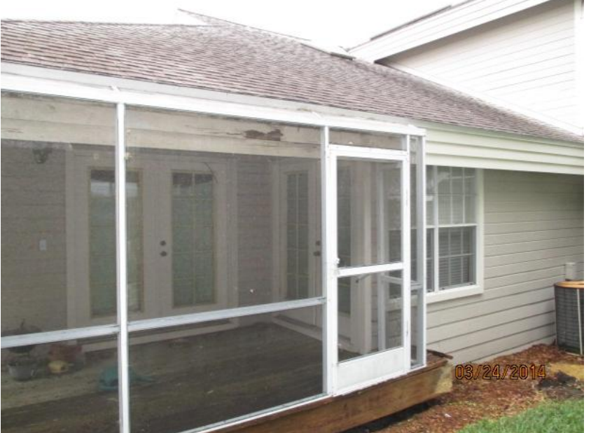
Unprotected Glazed Entry Doors