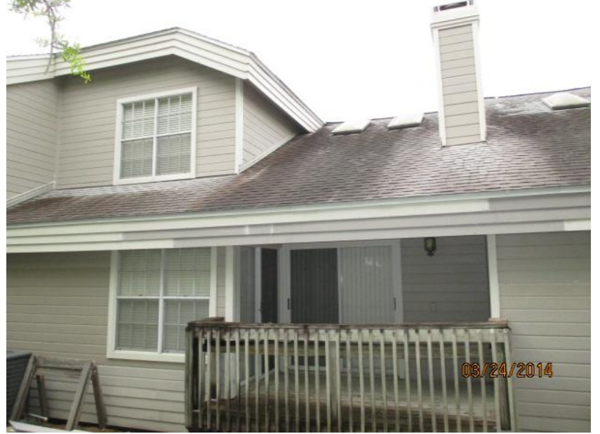
Unprotected Glazed Entry Doors