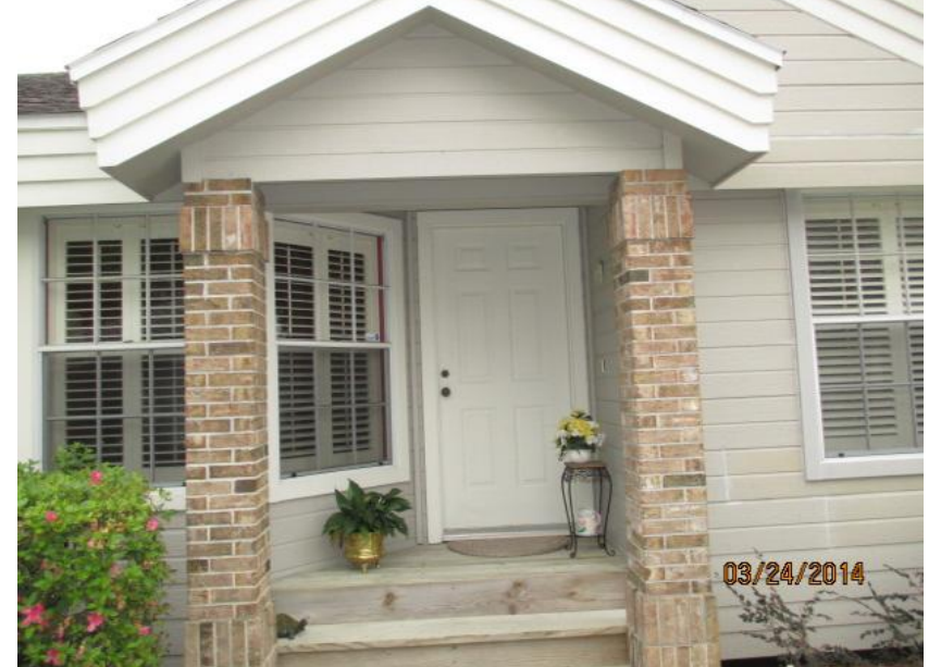
Unprotected Solid Entry Door