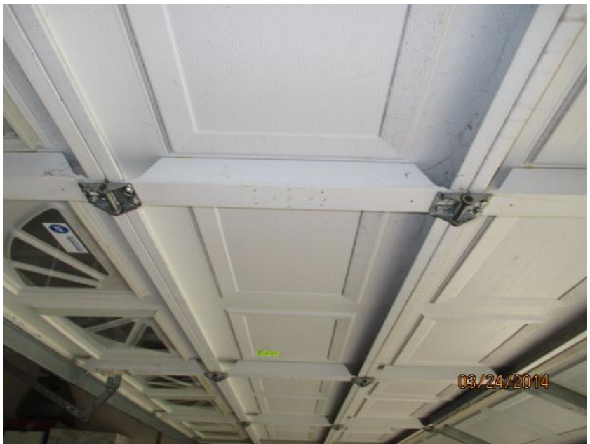
Unprotected Glazed Garage Door