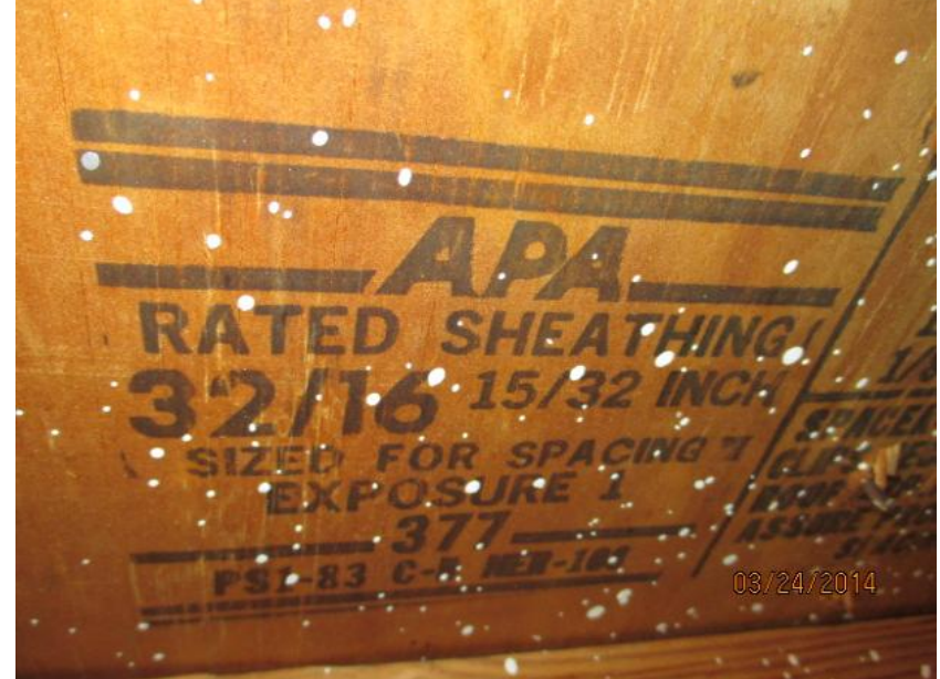
15/32" Deck Thickness Confirmed