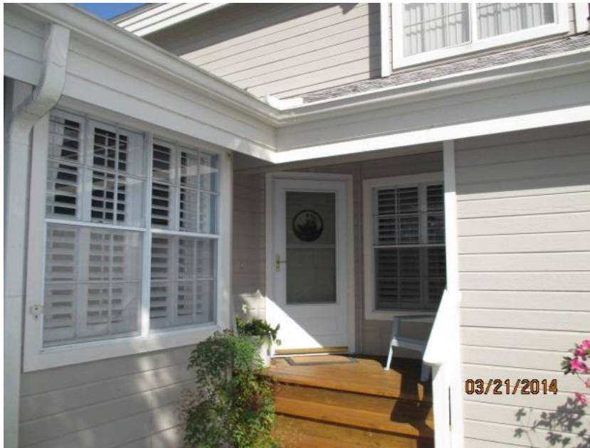
Unprotected Solid Entry Door