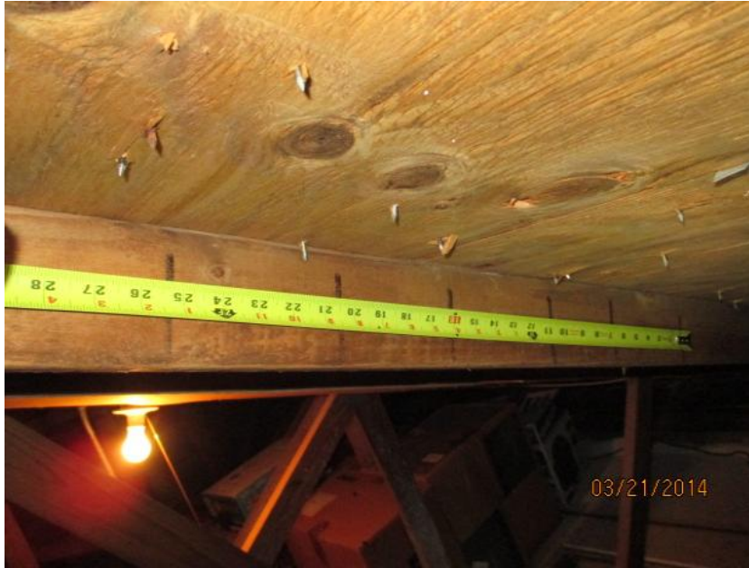
6d Nails Spaced 6" Along the Edge