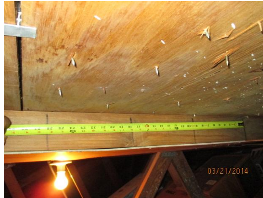
6d Nails Spaced 12" in the Field