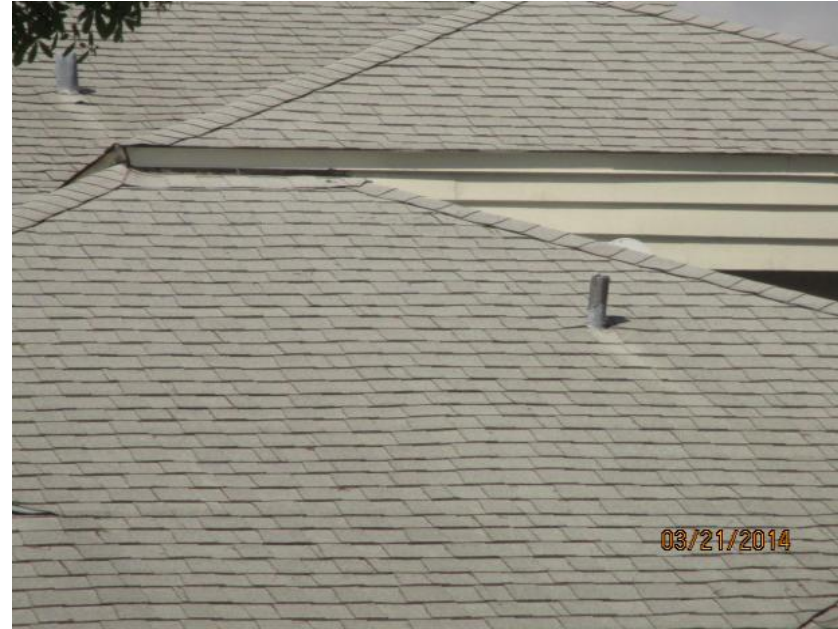
Asphalt/Fiberglass Shingle Roof Covering