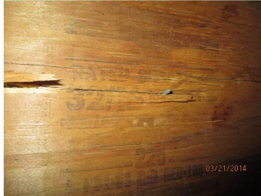
15/32" Deck Thickness Confirmed