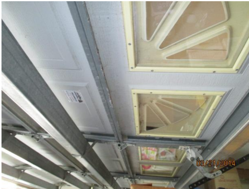
Unprotected Glazed Garage Door