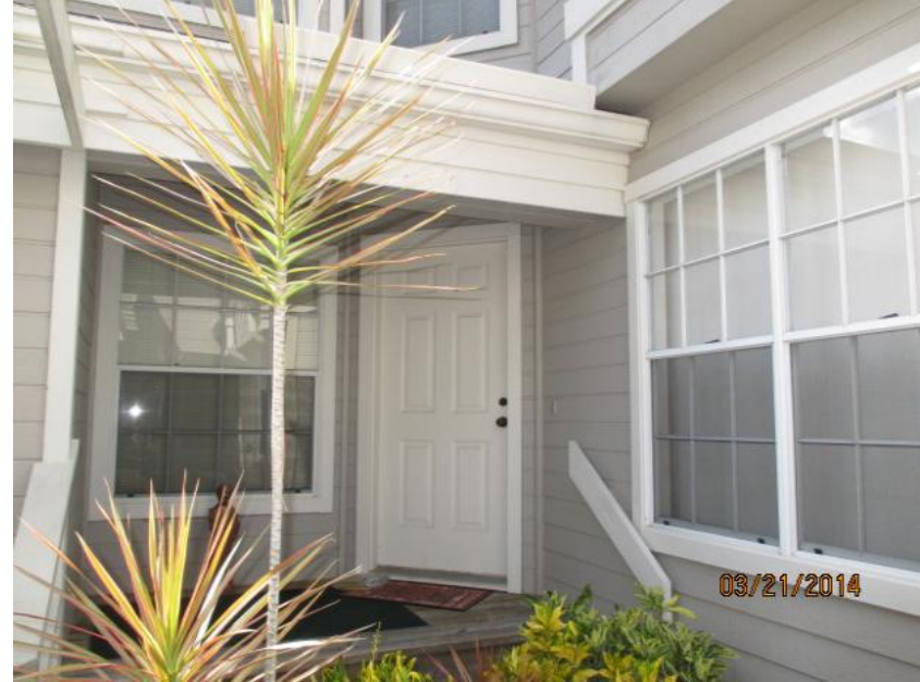
Unprotected Solid Entry Door