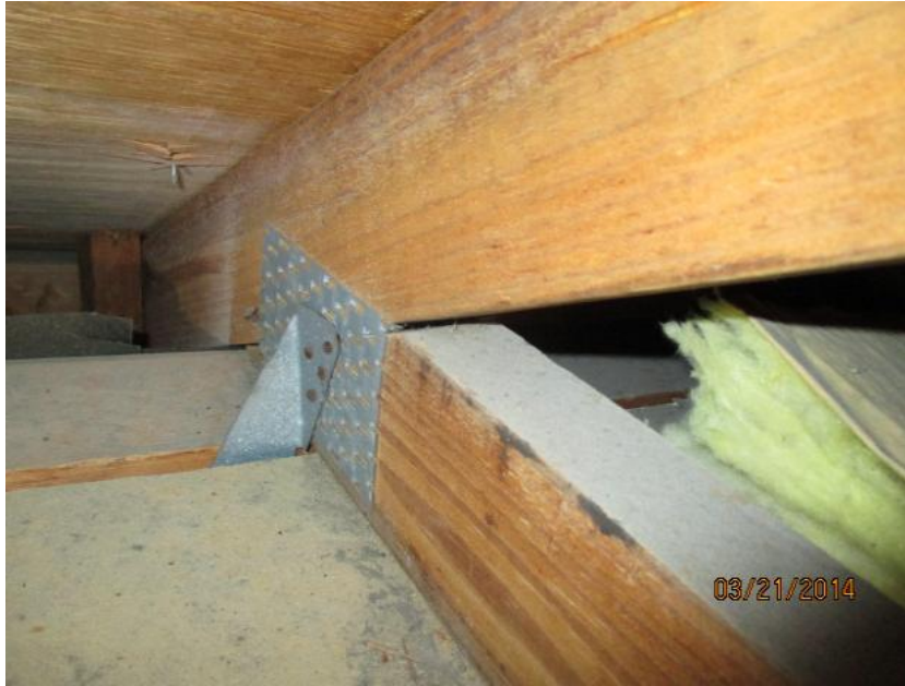
Clip with 4 nails on the front side and 0 nails on the opposing side