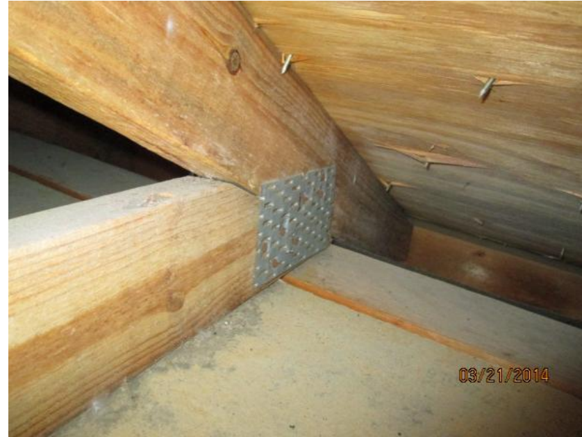
Clip with 4 nails on the front side and 0 nails on the opposing side